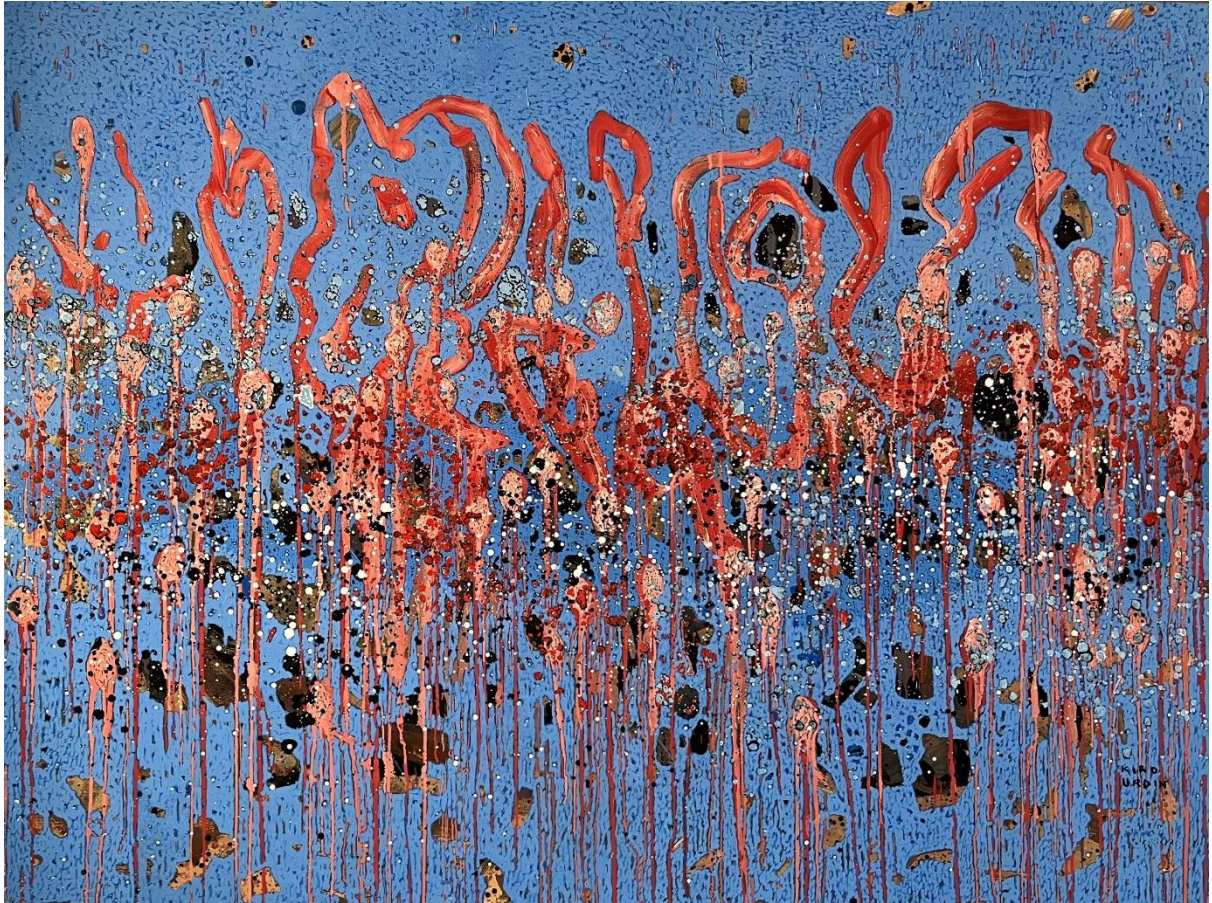
The Great Silence (2024)