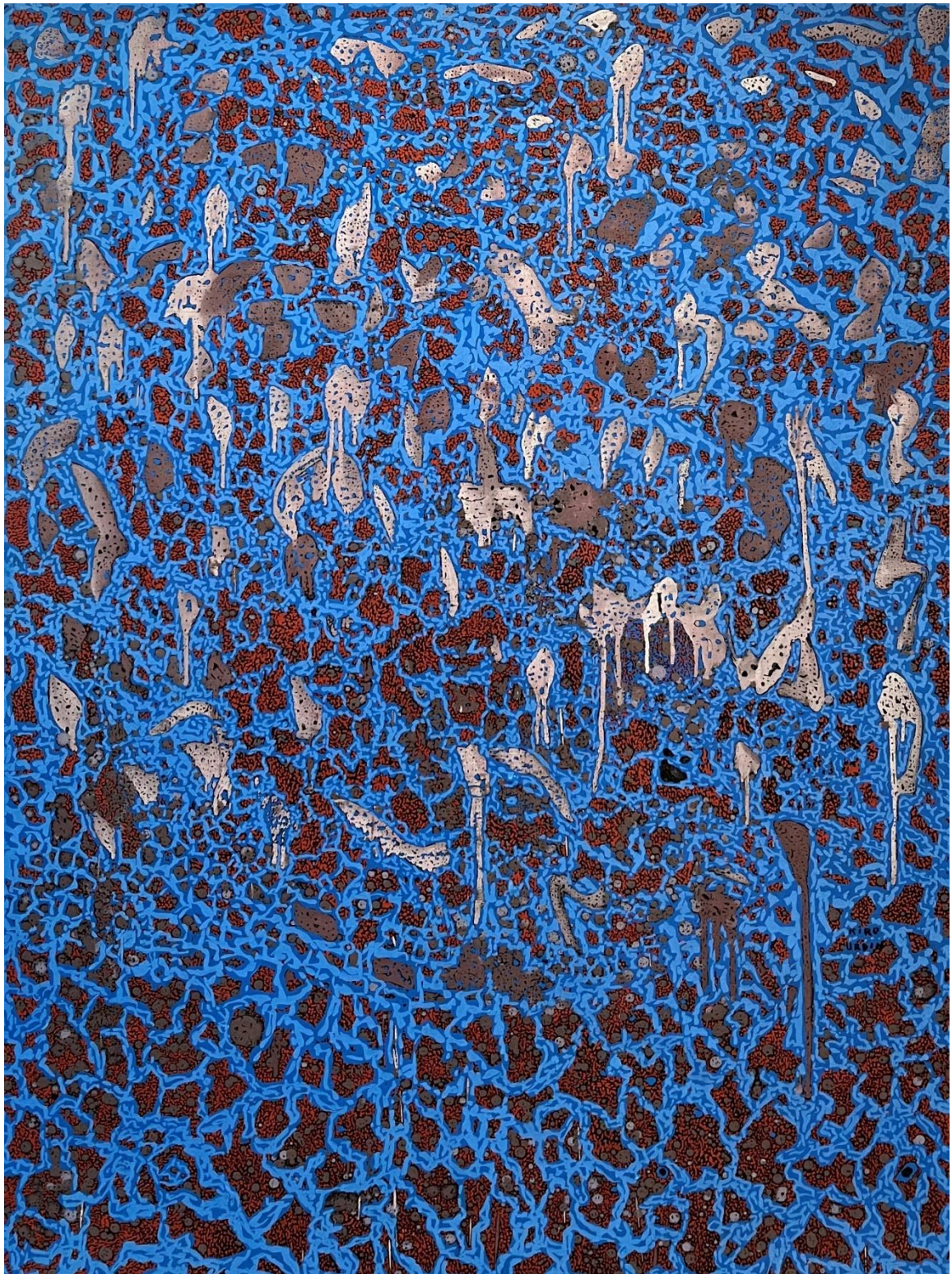
First Moment (2024)