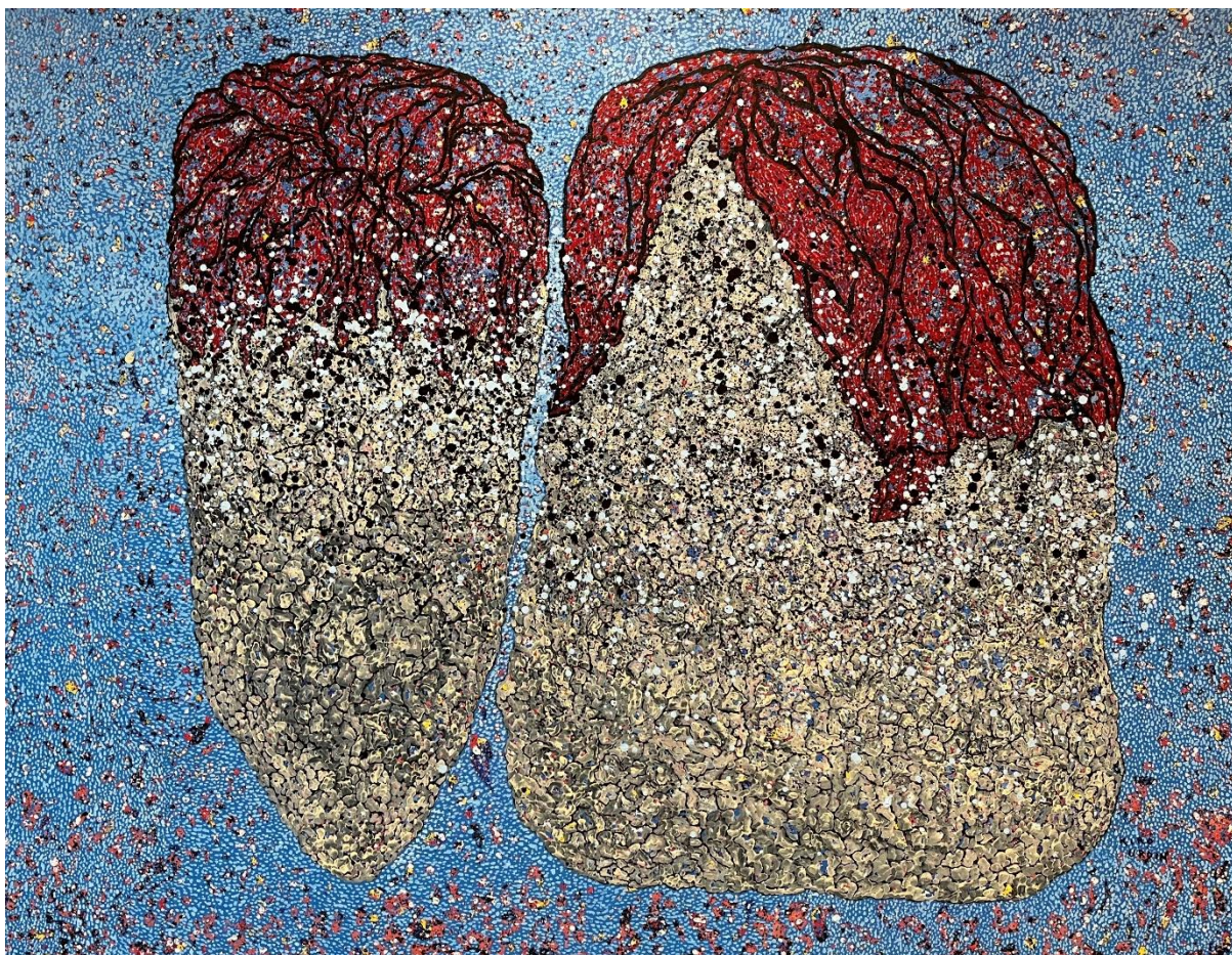
Second Moment (2024)